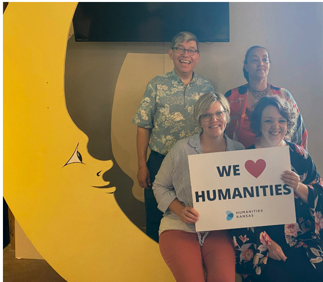
Hotel Humanities in Wilson