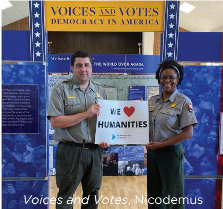
Voices and Votes, Nicodemus

Nonprofit Org. U.S. Postage PAID Kansas City MO Permit No. 523